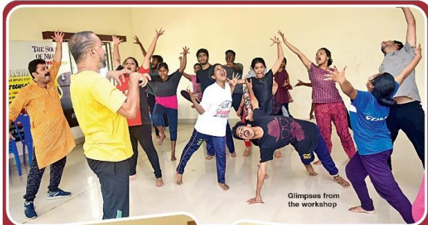
Glimpses from the workshop

He adds, "We included a lot of games and exercises, which have been devised by contemporary theatre practitioners and also those we ourselves designed. Given