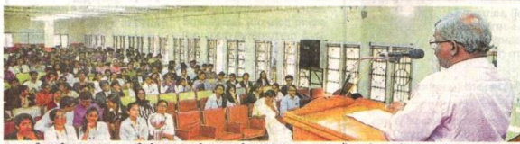
കൊച്ചി സർവകലാശാലയിൽ മോഡൽ യൂണിറ്റ് സമ്മേളനം. വൈസ് ചാൻസലർ ഡോ.ആർ.ശശിധരൻ ഉദ്ഘാടനം ചെയ്യുന്നു.